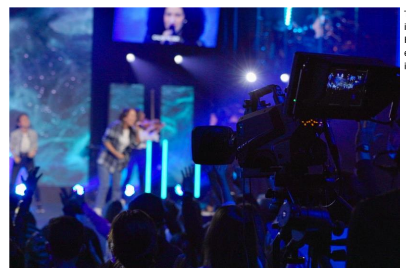
The Sennheiser EW-D system is complemented by Neumann KH 80 Monitors so that everything is heard exactly as intended.

In addition, the versatility provided by the 40 channels of Sennheiser Evolution Wireless Digital and In Ear Monitoring systems make the performances_optimal for the musicians, clergy and the church members. This is complemented by Neumann KH_80 Monitors so that everything is heard exactly as intended.