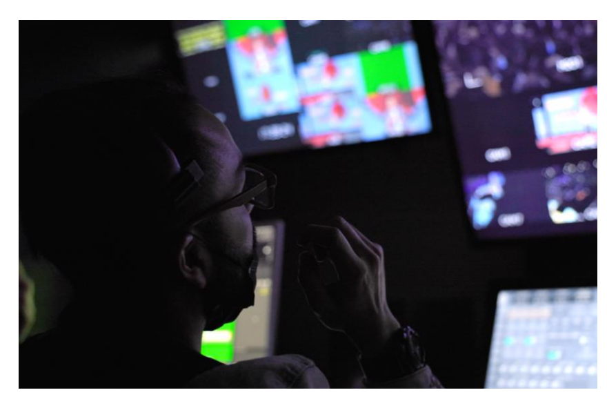
El Lugar de su Presencia relies on Sennheiser wireless sy: and vocal microphones to clearly transmit message in person and online.

Sennheiser's main distributor in Colombia, SR Importadores brought the system to the church AV team to test out as they were looking to replace their previous non-Sennheiser system. They were delighted by the sound quality as well as wireless fidelity. Since then, they have relied on Sennheiser for all their wireless audio needs.