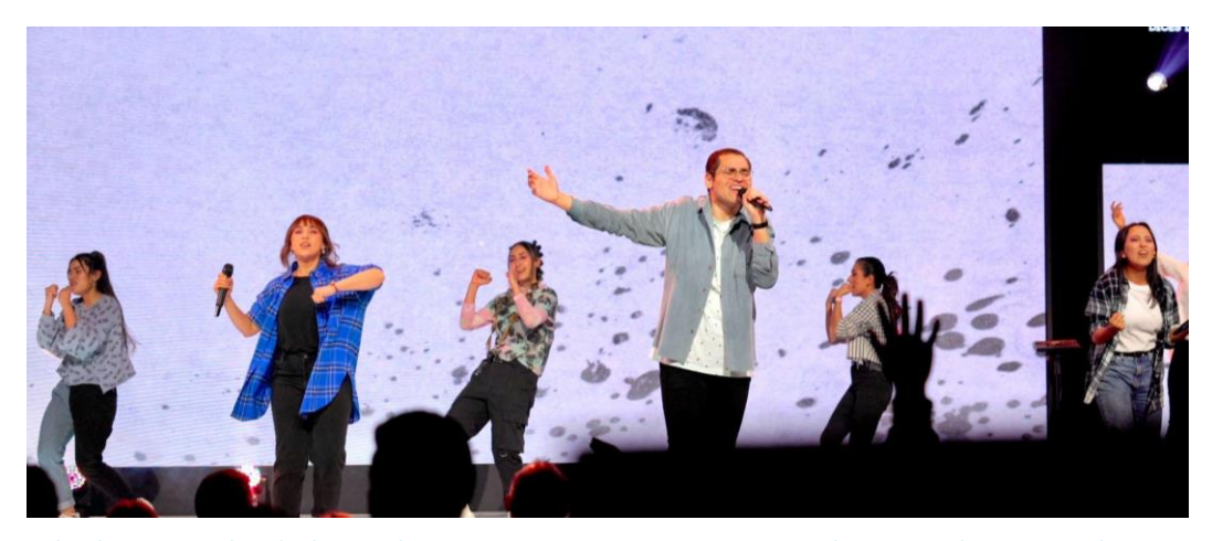
Colombian mega church El Lugar de Su Presencia conveys its message with new Sennheiser Digital 6000 and Evolution Wireless Digital systems

With 80,000 members and 8 locations across Colombia, the house of worship relies on Sennheiser audio solutions to amplify its in-person and online services